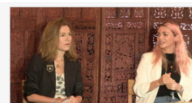
Dreams of Equality: What Does Mainstream Feminism Promise

The Longest War: Women & Power. Part 1. This three part series deals with issues of women's rights in Britain. The series focuses on the 20 th century, but it