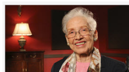
Outlier: The Story of Katherine Johnson

The USA University Libraries have a number of streaming video resources to help you celebrate Women's History Month and learn more about the achievements of women. The following is a list of a few films available through these services, but this