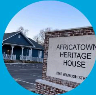
“Clotilda: the Exhibition at the Africatown Heritage House”