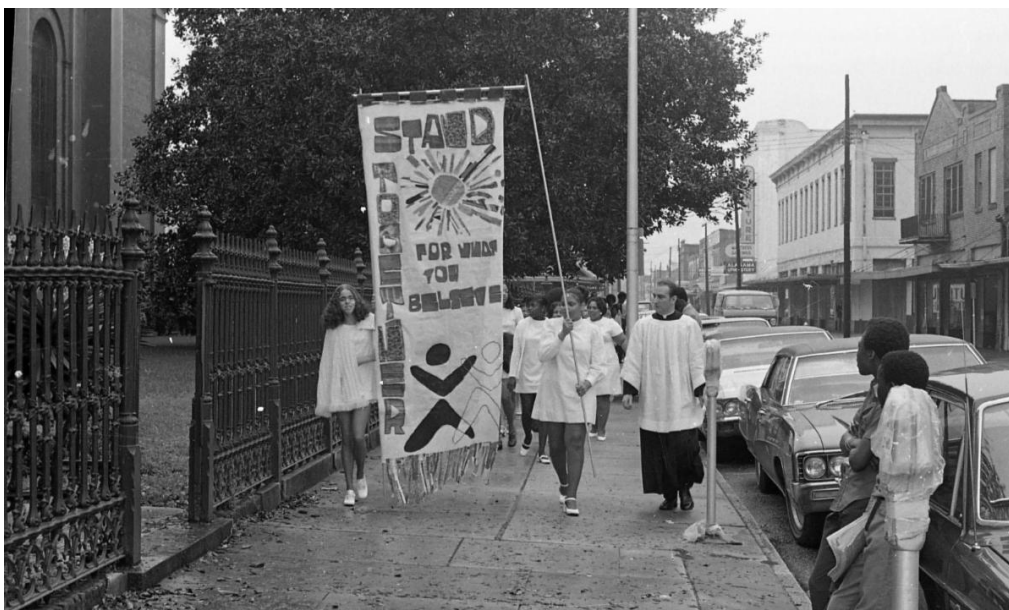
(1973 image)

The McCall Library again received a grant from the David Mathews Center for Civic Life for the successful Delta Fellows program piloted in 2019. This program supports a cohort of students who engage in a semester of study on civic engagement and local history and then a related hands-on summer internship.