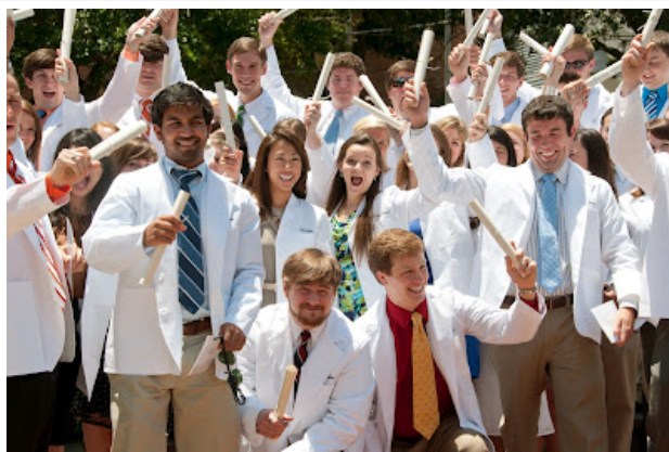
2011 White Coat Ceremony

The University of South Alabama College of Medicine will hold its annual White Coat Ceremony at the USA Mitchell Center on June 23, 2012, at 10 a.m. During the ceremony, rising third-year medical students will be cloaked with their first white coats, the traditional dress of physicians for more than 100 years.