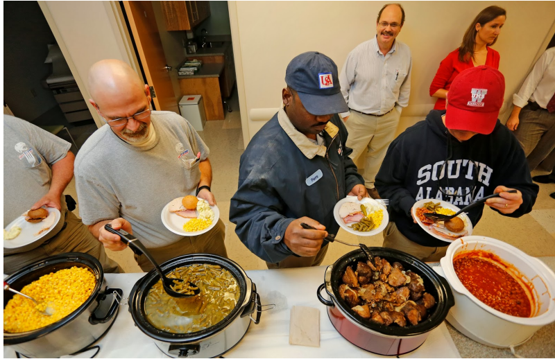
Construction crew members get food during a reception in their honor at the newly relocated USA Digestive Health Center.