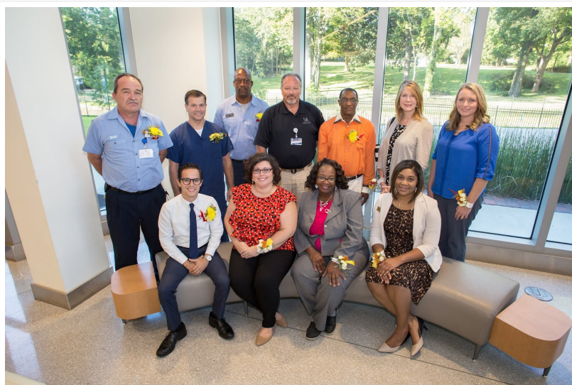
Several USA Health employees were nominated for the Christie Miree Award and named to the US-A Team.

The University of South Alabama recently honored several USA Health employees as nominees and winners of the 2018 Christie Miree USA National Alumni Association Outstanding Employee Awards. The Christie Miree recipients were chosen from the US-A Team, which recognizes outstanding employees who are nominated by their peers.