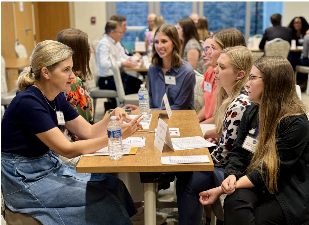
Medical students participate in speed-interview-style rotations with physicians at the MAA Student Career Exploration Mixer.

The USA Medical Alumni Association hosted more than 45 Whiddon College of Medicine students and 24 physicians, representing 18 unique specialties, at the MAA Student Career Exploration Mixer. The event, held for the first time since 2019, took place Tuesday, April 2, at the Strada Patient Care Center.